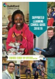
Supported Learning Course Guide