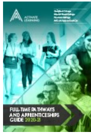
Full-Time Pathways and Apprenticeships Guide